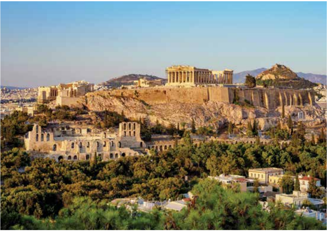
On Day 3 we visit the Acropolis in Athens.

Day 6: Mycenae/Epidauros It's a day steeped in ancient history as we first tour the imposing ruins at Mycenae, a UNESCO site that represented the pinnacle of civilization from the 15 th to the 12 th centuries BCE. A key influence on the development of classic Greek culture (and hence Western civilization), Mycenae also is linked to Homer's epics, Iliad and The Odyssey . We see the Tomb of Agamemnon, with what was the world's highest and widest dome for more than a thousand years, and the Lion's Gate, the only known Bronze Age monumental sculpture in Greece. We move on the vast archaeological site and museum of Epidauros, with its 2,300-year-old theater – a master-piece of Greek architecture known for its perfect acoustics – still in use today. Long associated with healing and medicine, Epidauros comprises one of the most complete sanctuaries remaining from antiquity. Then we return to Nafplion, where the afternoon is free for lunch on our own and perhaps to explore this gem of a Venetian/Byzantine town with picturesque narrow streets, fortifications, and a bounty of waterfront cafés. Tonight, we enjoy dinner together at a local taverna . B,D