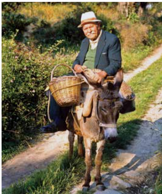
Old ways endure ...