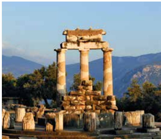
On Day 4, we tour the ruins of Delphi.

Day 14: Depart for U.S. We transfer to Athens’ international airport this morning, where we connect with our return flight home. B