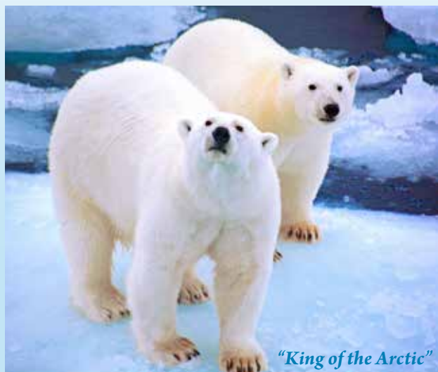
"King of the Arctic"

Voyage through the otherworldly Arctic Circle on this unique 11-day itinerary featuring an extraordinary seven-night cruise on the Five-Star L'Austral, exclusively chartered for your expedition. Visit during the region's most enchanting season, when the sun never sets. Sail the shores of secluded Spitsbergen, the jewel of Norway's rarely visited Svalbard archipelago, and enjoy Zodiac excursions in diverse terrains, led by expert naturalists, where remarkable wildlife—from whales and walruses to Svalbard reindeer and Arctic foxes—roam freely. Complimentary Wi-Fi and alcoholic and nonalcoholic beverages on cruise. Overnight accommodations are included in Paris for the program's flights to/from Longyearbyen. Paris Pre-Program Option available.