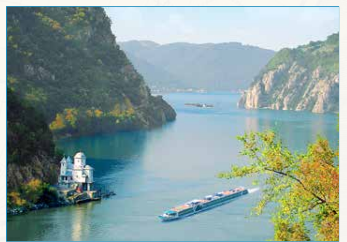
Look for the Monastery of Mraconia ("hidden place") as you cruise the Danube River's dramatic Iron Gates.