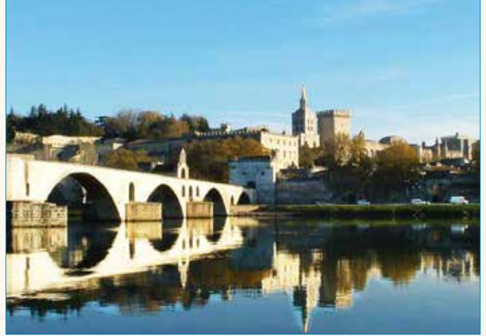
The landmark Pont d'Avignon was the only bridge built across the River Rhône during the Middle Ages.