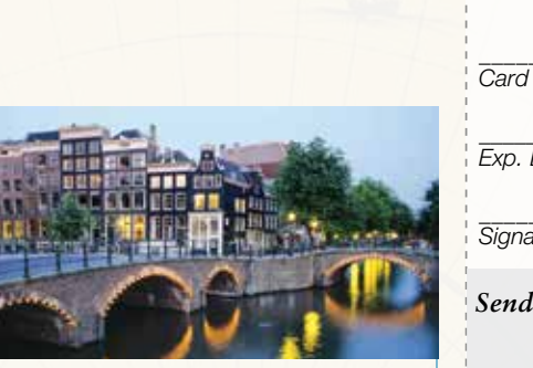
AMSTERDAM POST-PROGRAM OPTION

The Travel Program outlined here is subject to the features, final pricing and terms and conditions set forth in the published Travel Program brochure. Upon receipt of the published Travel Program brochure, you will be given 10 days to reconfirm your reservation, at which time any deposit(s) will become subject to cancellation fees.