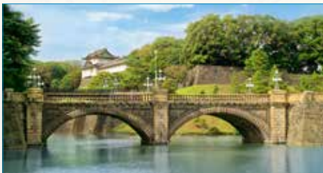
TOKYO PRE-PROGRAM OPTION