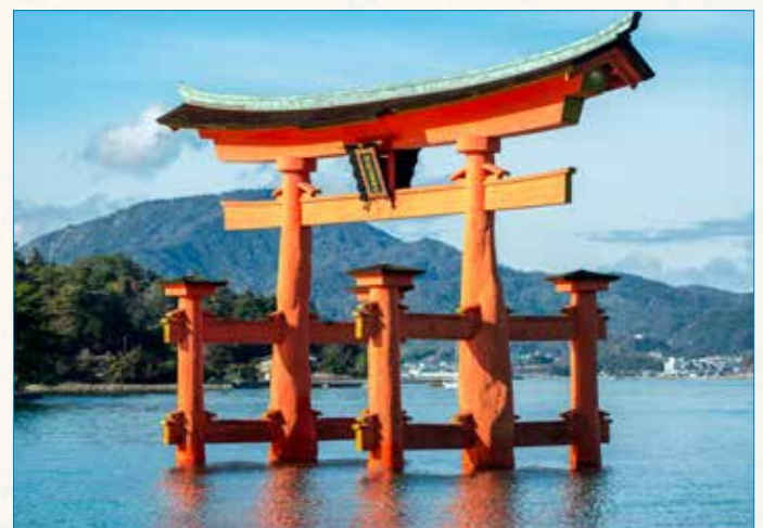
Miyajima's Great Torii Gate is thought to be the boundary between the spirit and the human worlds.