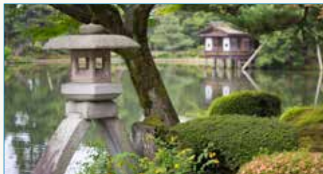
KANAZAWA POST-PROGRAM OPTION

The Travel Program outlined here is subject to the features, final pricing and terms and conditions set forth in the published Travel Program brochure. Upon receipt of the published Travel Program brochure, you will be given 10 days to reconfirm your reservation, at which time any deposit(s) will become subject to cancellation fees.