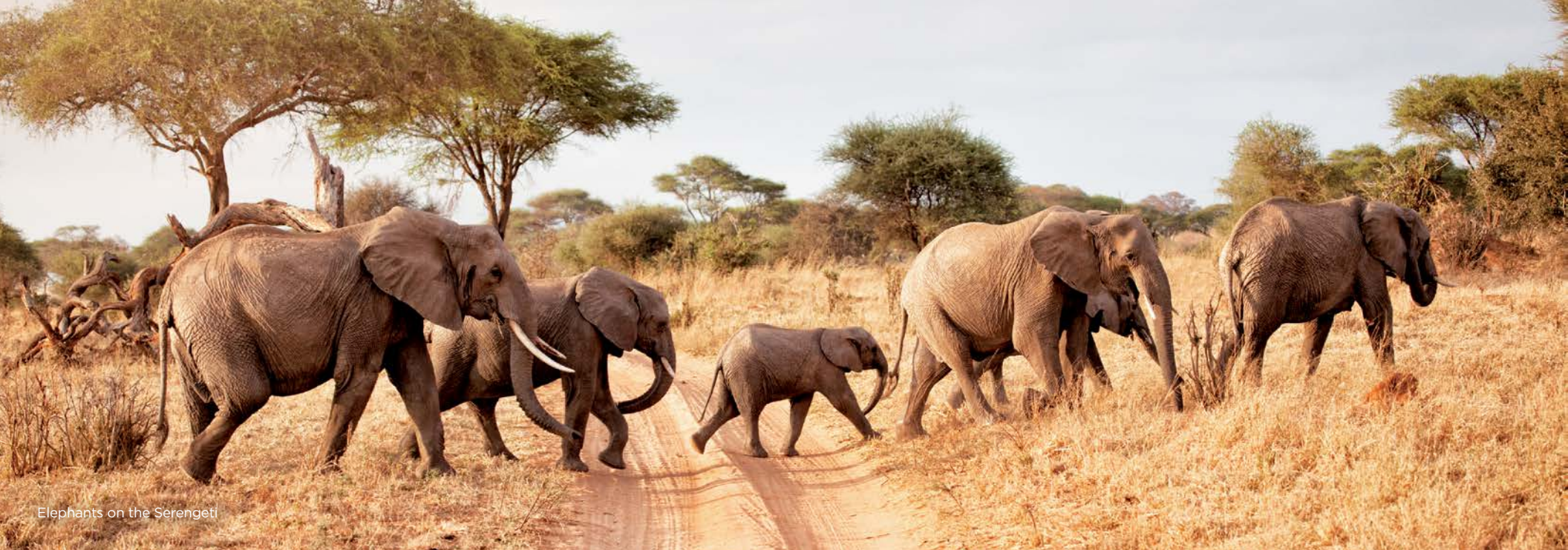
Elephants on the Serengeti