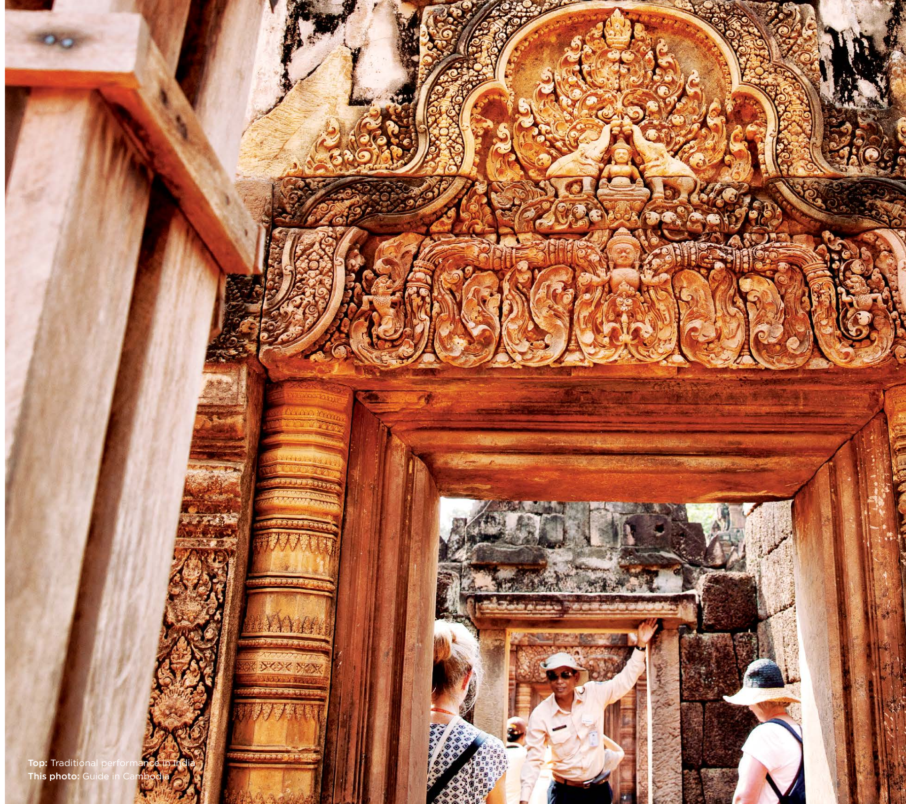
Top: Traditional performance in India This photo: Guide in Cambodia