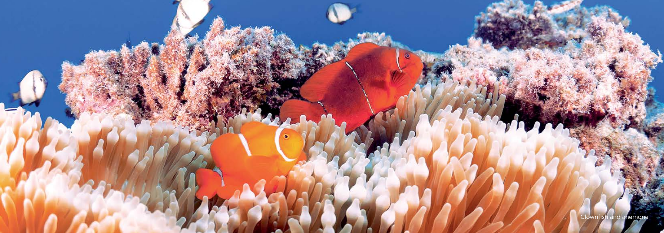
Clownfish and anemone