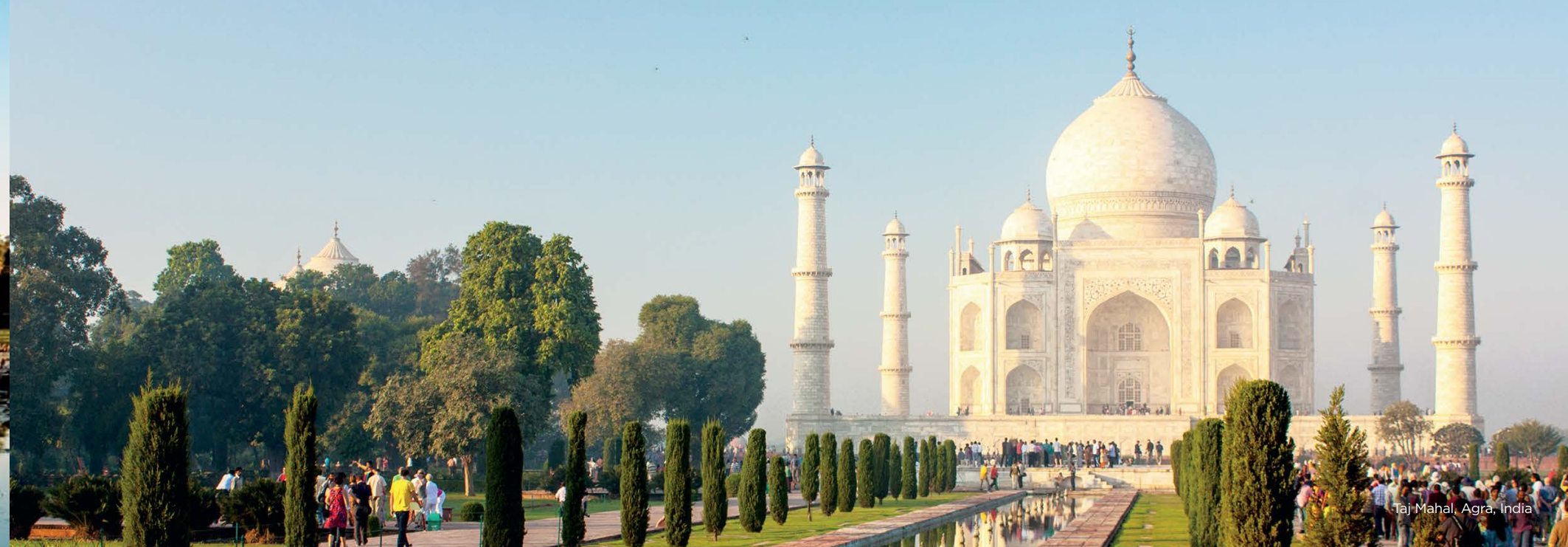
Taj Mahal, Agra, India

Accommodations: Just five miles from Angkor Wat, the Raffles Grand Hotel d'Angkor has been restored to its original colonial architecture and features elegant guest rooms.