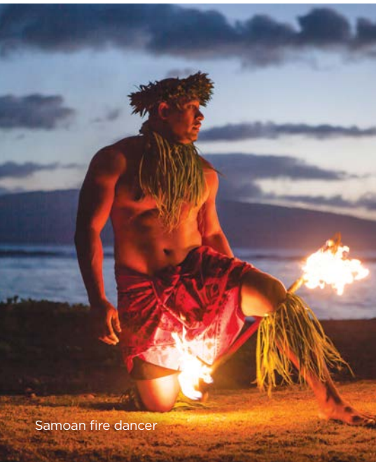
Samoan fire dancer

OCTOBER 3 – 4 Easter Island, Chile ✈️ Apia, Samoa: 9h 30m