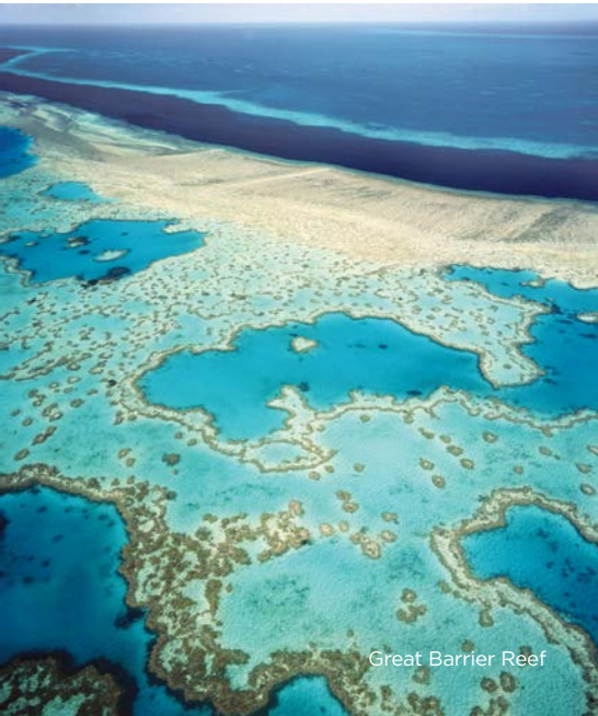
Great Barrier Reef

Accommodations: Stay at the Pullman Port Douglas Sea Temple Resort and Spa , set on the palm-lined Four Mile Beach.