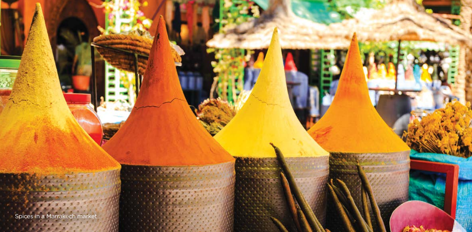
Spices in a Marrakech market