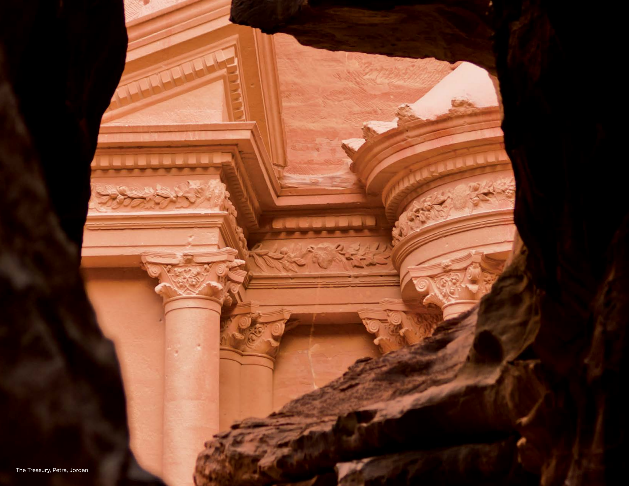
The Treasury, Petra, Jordan