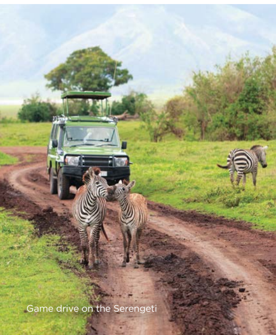
Game drive on the Serengeti