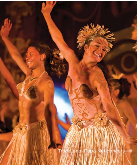
Traditional Rapa Nui dancers

Accommodations: The unique Hangaroa Eco Village and Spa was inspired by the ceremonial village of Orongo and features guest rooms made of volcanic rock, clay and cypress.