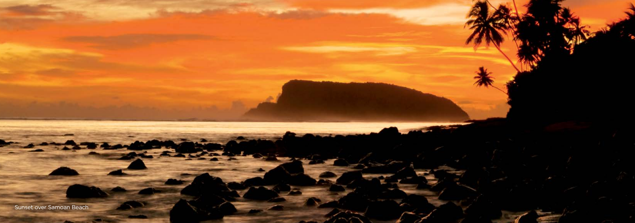
Sunset over Samoan Beach