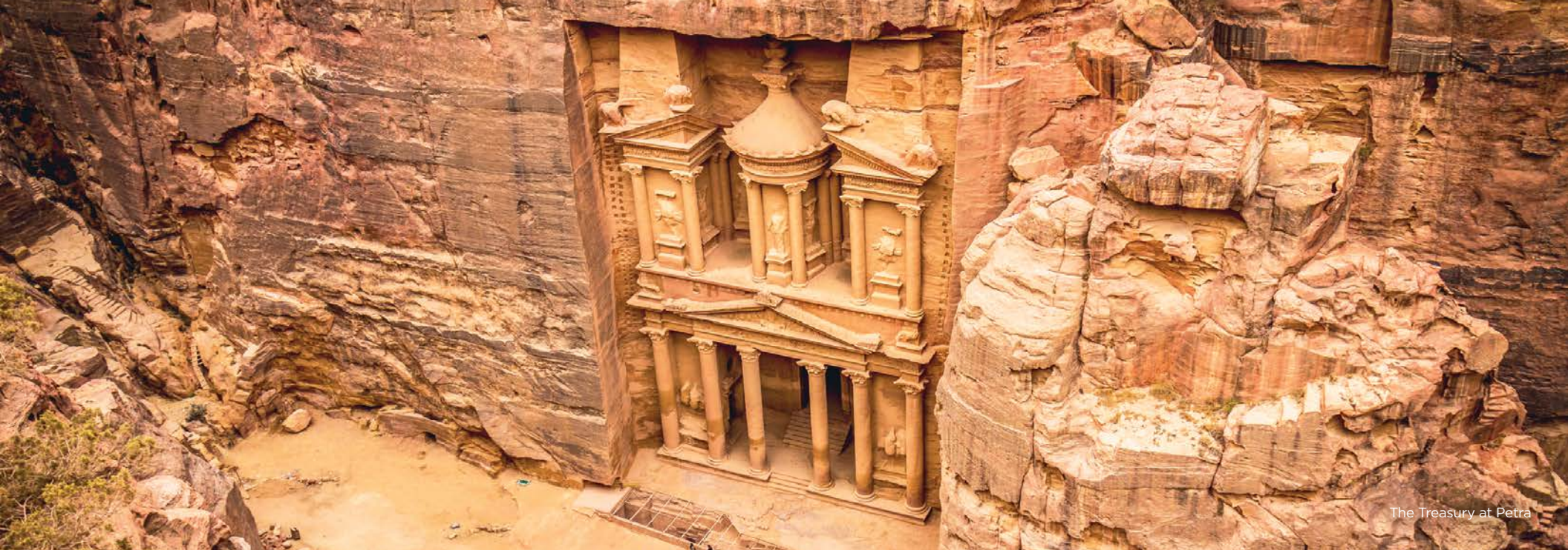
The Treasury at Petra