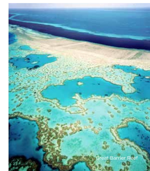
Great Barrier Reef

Accommodations: Stay at the Pullman Port Douglas Sea Temple Resort and Spa , set on the palm-lined Four Mile Beach.