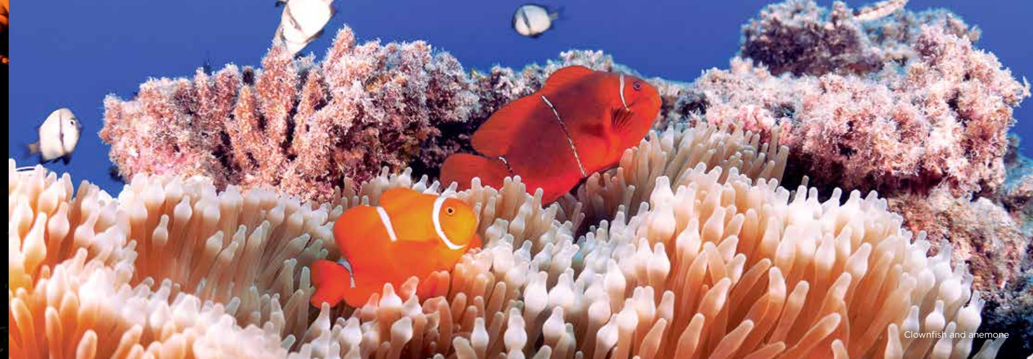
Clownfish and anemone