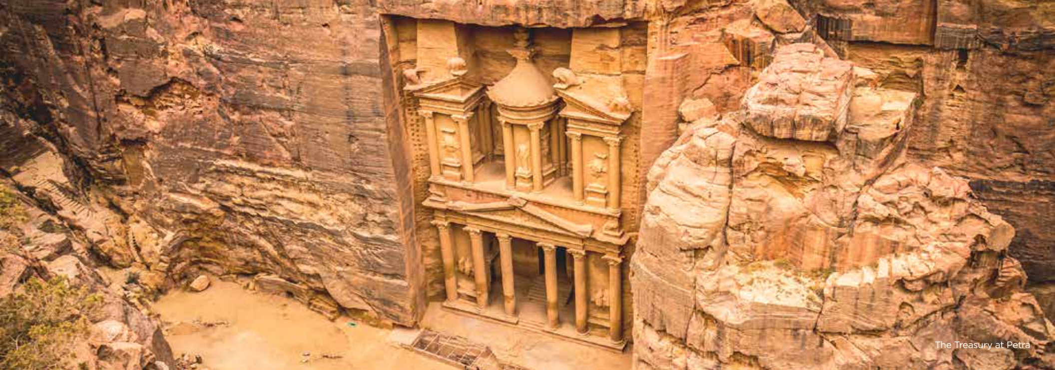
The Treasury at Petra