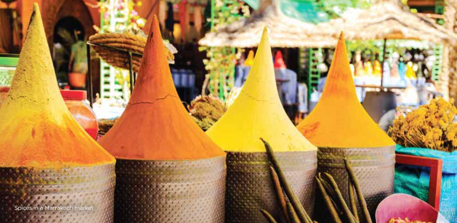
Spices in a Marrakech market