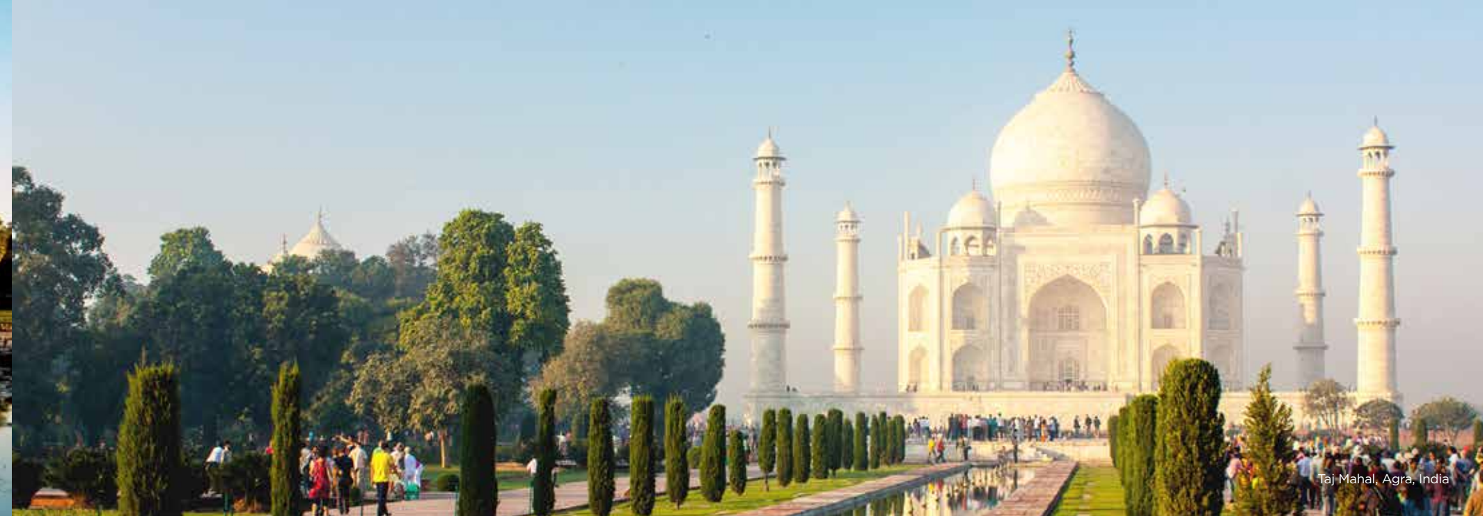
Taj Mahal, Agra, India

Accommodations: Just five miles from Angkor Wat, the Raffles Grand Hotel d'Angkor has been restored to its original colonial architecture and features elegant guest rooms.