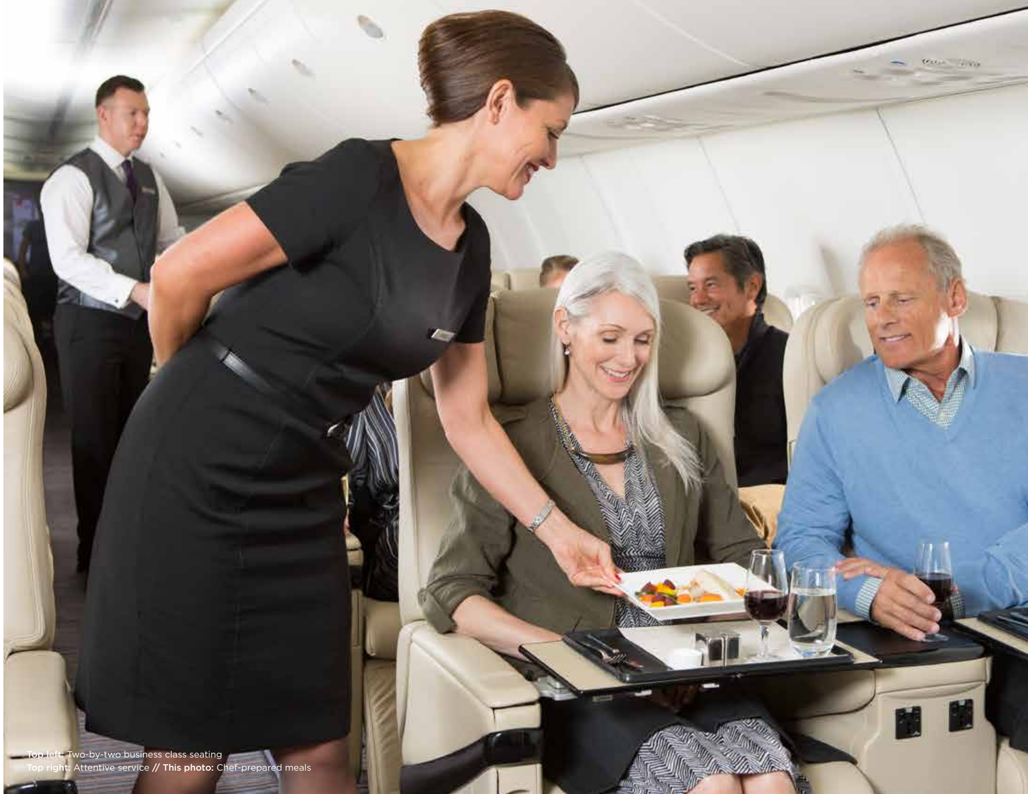
Top left: Two-by-two business class seating Top right: Attentive service // This photo: Chef-prepared meals

Discover a whole new way to explore the world. Around the World Classic is operated by TCS World Travel, the industry leader in private jet journeys. Tour the world effortlessly in the comfort and convenience of a custom Boeing 757 with unparalleled local access and exclusive activities tailored to your style. This trip will fly guests around the world on a private jet that offers two-by-two seating for 80 guests—versus 233 seats on a commercial aircraft. Flying by private jet allows you to explore more iconic destinations and experience more of what the world has to offer in a single journey.