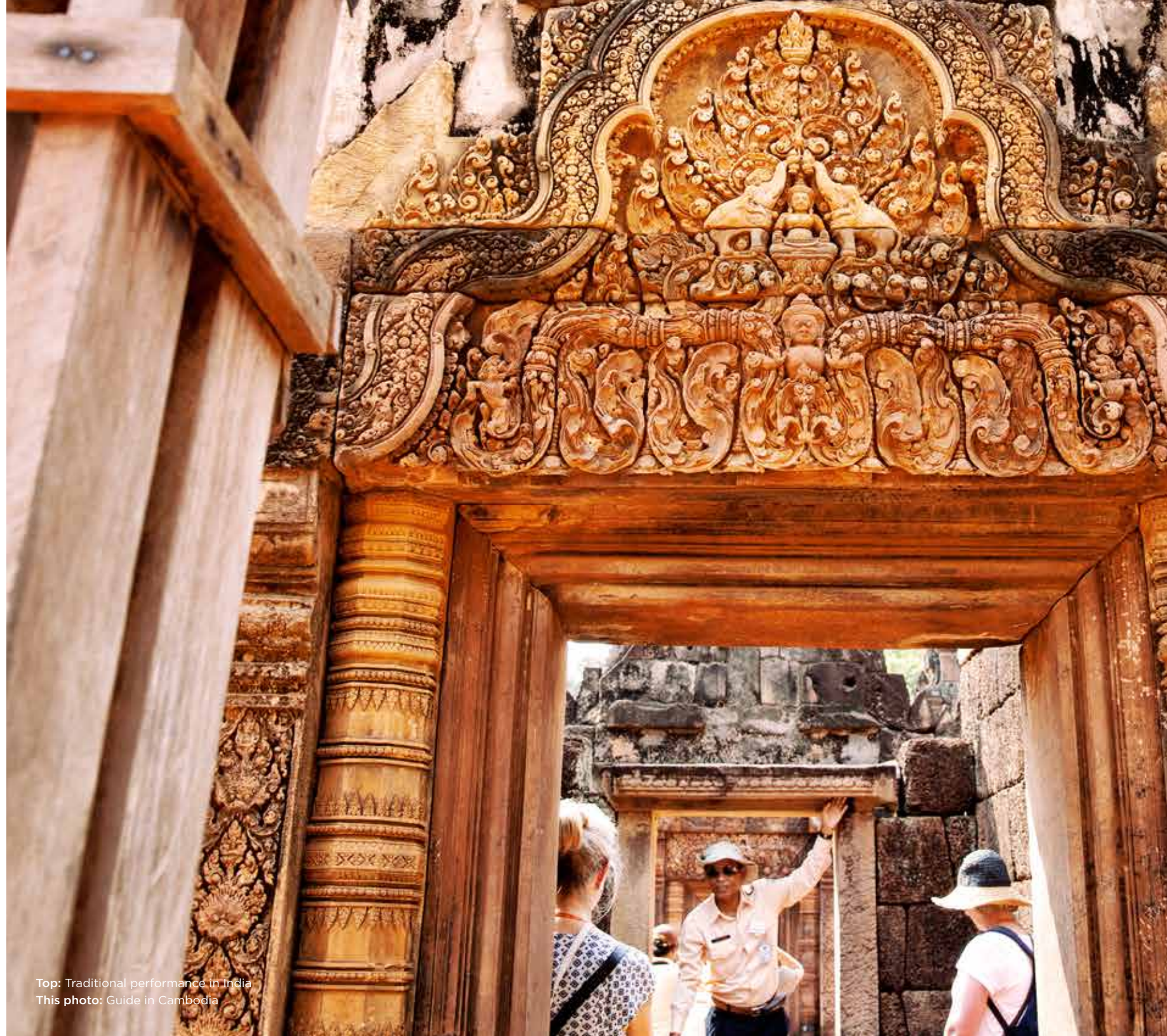
Top: Traditional performance in India This photo: Guide in Cambodia