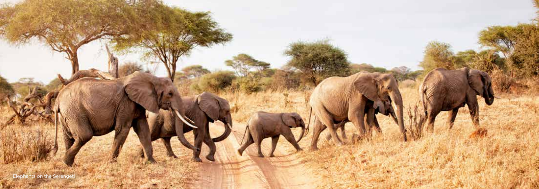
Elephants on the Serengeti