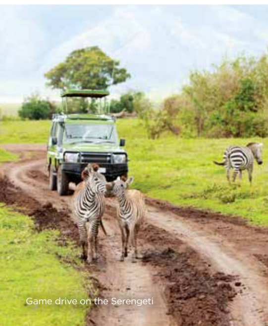
Game drive on the Serengeti

OCTOBER 12 - 14 Agra, India ✈️ Kilimanjaro, Tanzania: 7h 45m + local flight