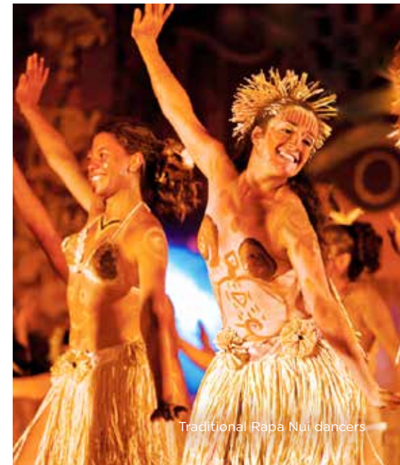
Traditional Rapa Nui dancers

Accommodations: The unique Hangaroa Eco Village and Spa was inspired by the ceremonial village of Orongo and features guest rooms made of volcanic rock, clay and cypress.