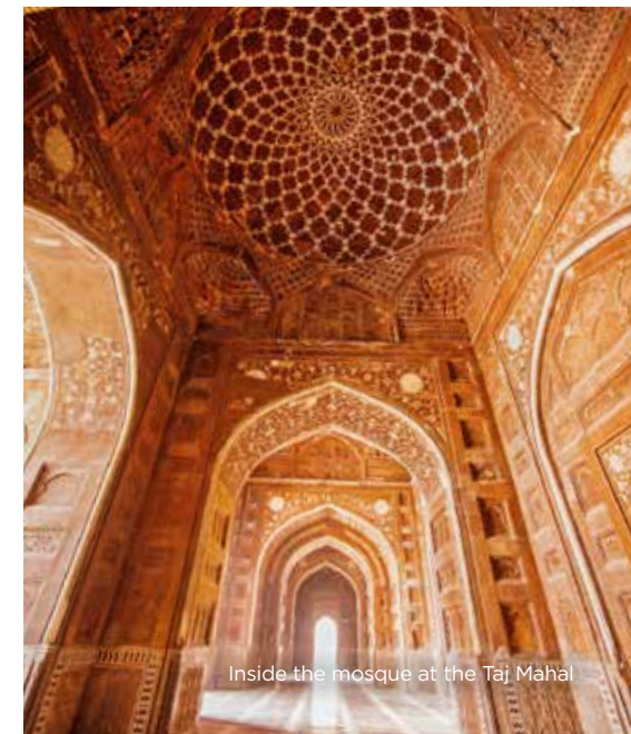
Inside the mosque at the Taj Mahal

Accommodations: One of the finest hotels in the world, The Oberoi Amarvilas overlooks the Taj Mahal, providing stunning views of this monument.