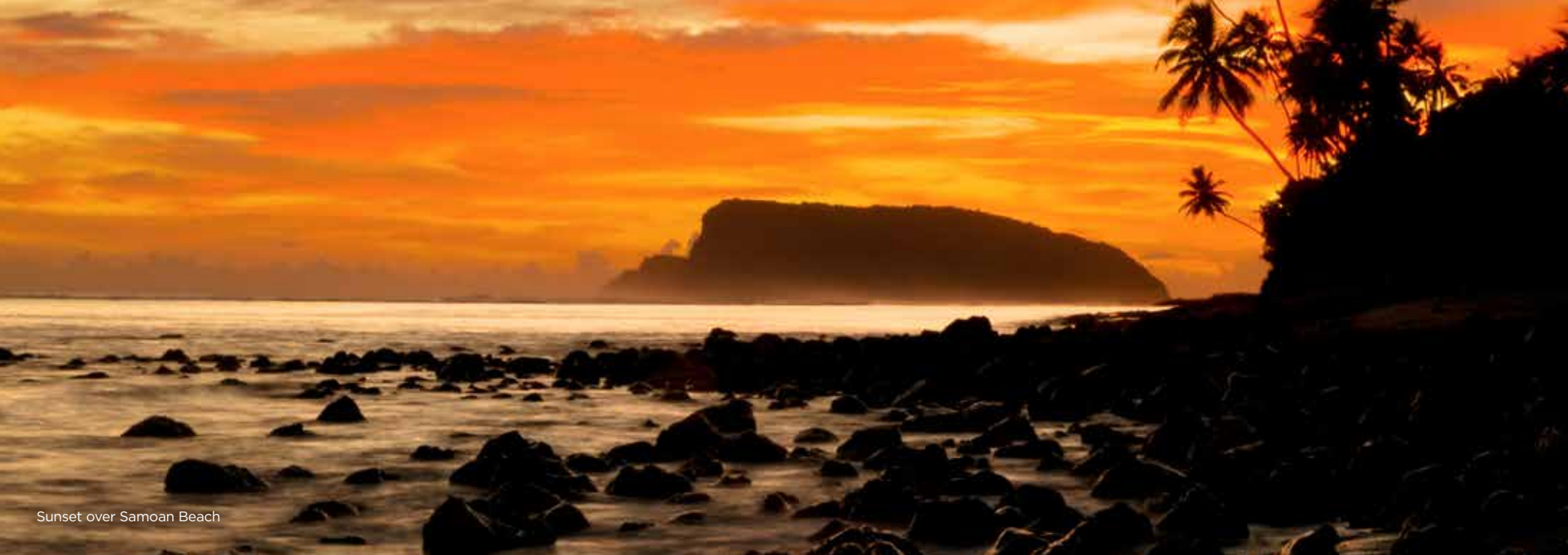
Sunset over Samoan Beach