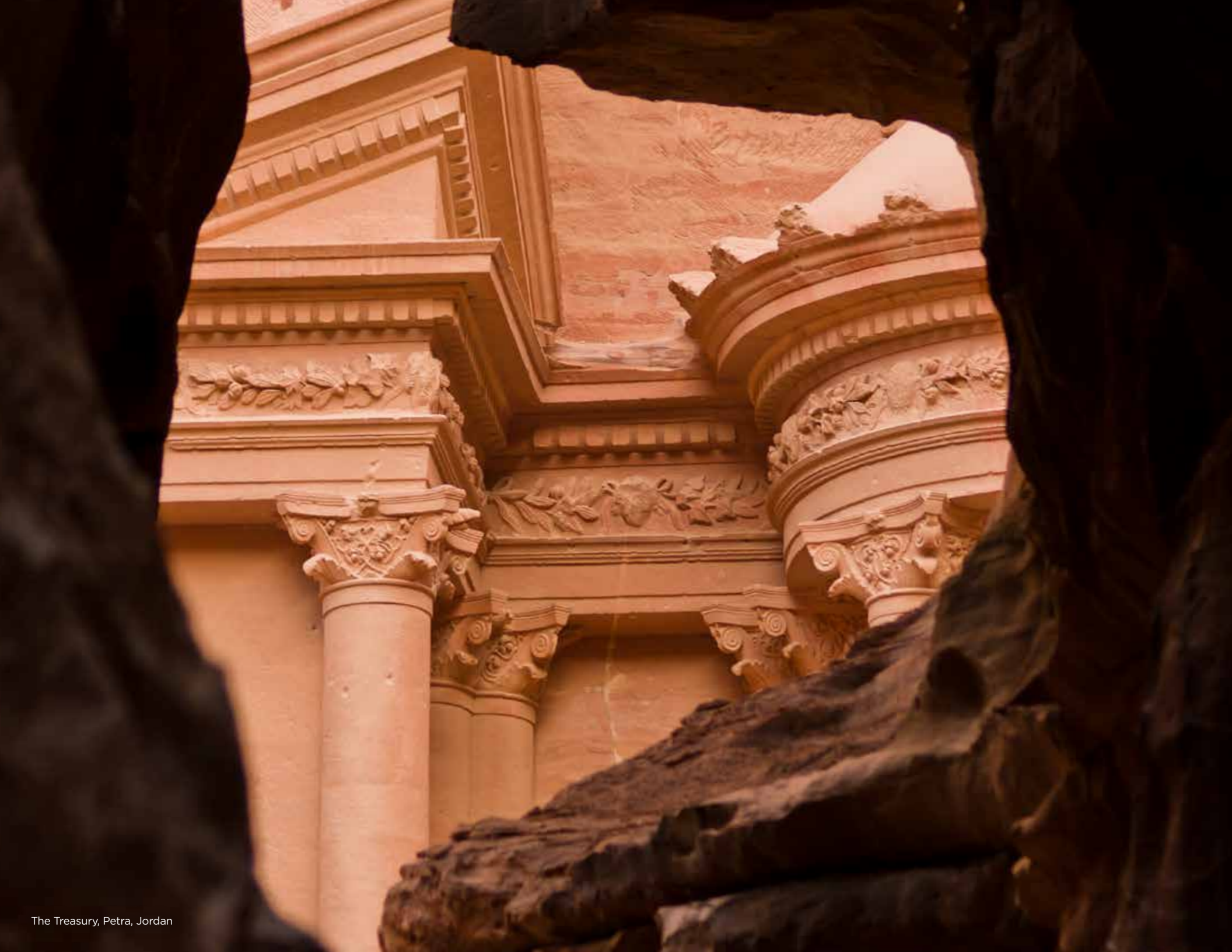
The Treasury, Petra, Jordan