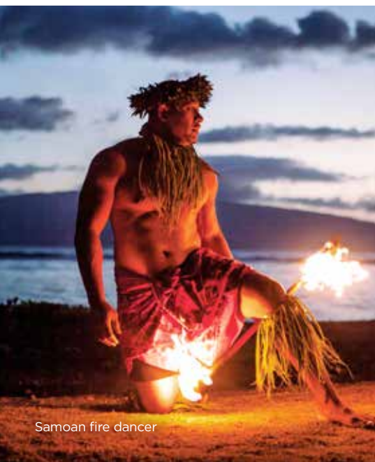
Samoa fire dancer

OCTOBER 3 - 4 Easter Island, Chile ✈️ Apia, Samoa: 9h 30m