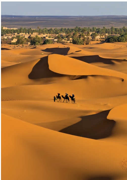
We watch the sun set over the dunes at Merzouga on Day 8.

Day 14: Depart for U.S. After breakfast this morning we transfer to the airport for our return flight to the U.S. B