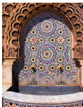
Traditional Moroccan tile work

Day 12: Marrakech This morning we travel by horse-drawn carriage from Menara Park to Majorelle Gardens, a private botanical garden with some 15 species of birds native to North Africa and known