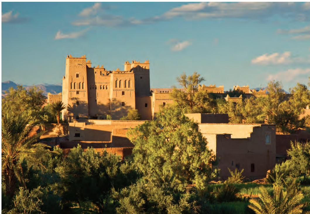
A typical kasbah, as we see along the “Route of a Thousand Kasbahs” on Days 9 & 10.

quarter) and its 17 th -century synagogue, the royal gates, and the Museum of Fez. Tonight we enjoy a private dinner at an intimate family-run riad in Fez. B,L,D