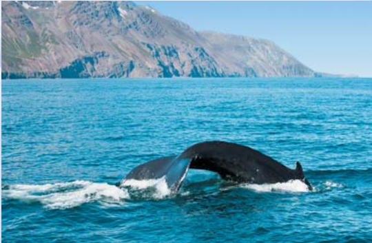
Wildlife-rich Skjálfandi Bay is an ideal place to look for diverse marine life such as the protected humpback whale.

This evening, join your traveling companions for the Captain’s Farewell Reception.