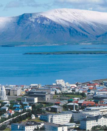
Reykjavík was a simple fishing village and trading post when Iceland was a self-governing Iceland under the Danish king in the 13th century. Thirty years later.