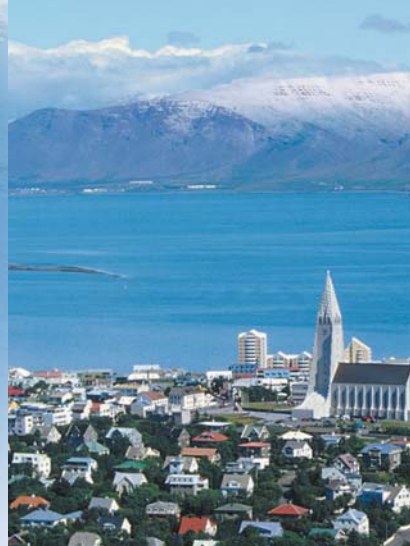
The largest city in Iceland, charming Reykjavík has been a settlement for centuries until becoming the capital of a new nation in 1918 and of an independent Iceland nearly 50 years later.