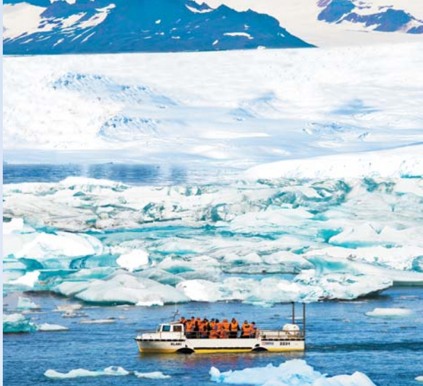
A private cruise on an amphibious vehicle provides the ideal up-close encounter with the miles of icebergs floating in Jökulsárlón glacial lagoon.

Board a small boat for a private cruise amongst the breathtaking icebergs of this spectacular lagoon and actually touch the ice that has calved off the outlet tidewater glacier, Breidamerkurjökull. On clear days, look for the awe-inspiring Vatnajökull Ice Cap, Europe's largest glacier.