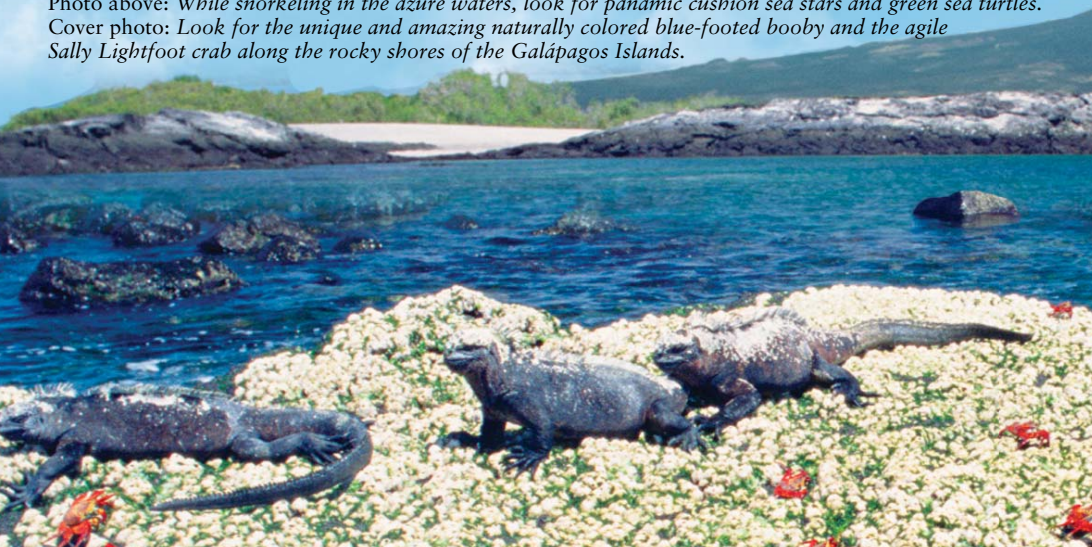
Photo this page: Watch marine iguanas, found only in the Galápagos Islands, basking in the afternoon sun. Photo above: While snorkeling in the azure waters, look for panamic cushion sea stars and green sea turtles. Cover photo: Look for the unique and amazing naturally colored blue-footed booby and the agile Sally Lightfoot crab along the rocky shores of the Galápagos Islands.

This morning, the panoramic city tour features a visit to the noble, 16 th -century church, Iglesia de San Francisco.