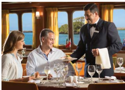
Beagle Dining Room