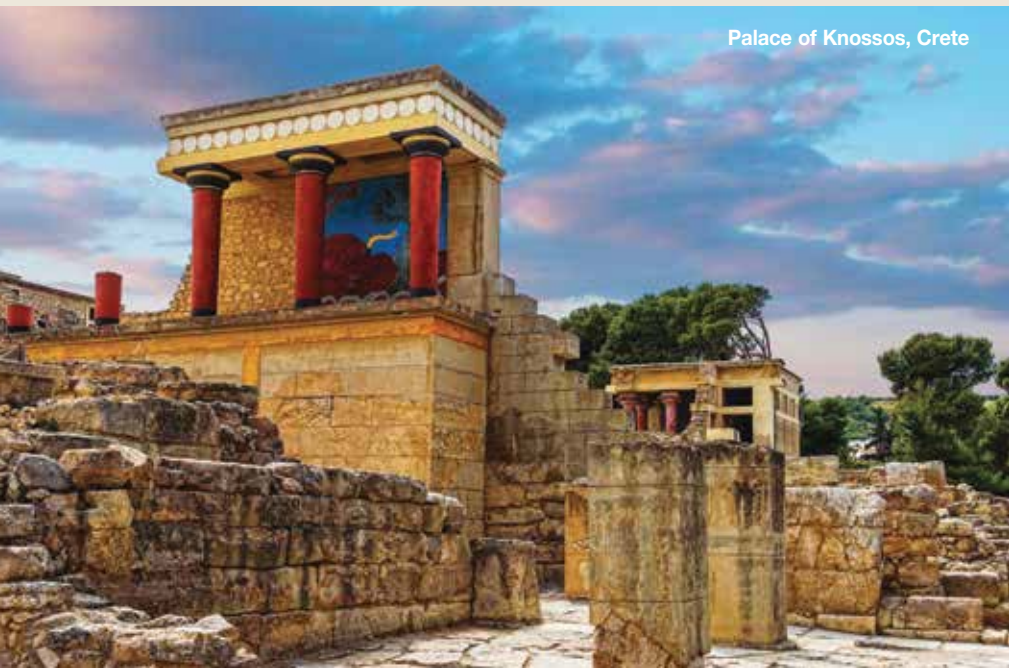
Palace of Knossos, Crete

All stateroom/suite locations and prices are subject to availability. Deposit and cancellation policies for categories OS, VS, and OC differ from those listed in this brochure. Please call for details.