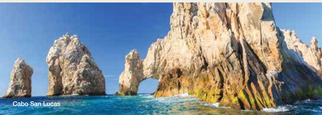
Cabo San Lucas

OR GO NEXT: 800-842-9023 • FAX: 952-918-8975