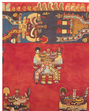
Traditional Peruvian fabric

highest navigable lakes. Up here the air is clearer, the colors sharper, and the horizon farther. By boat we visit the Floating Island of Los Uros, where the top-hatted Uros people live on “islands” made of the reeds that grow in the lake’s shallows; in fact, the Uros rely on these reeds for their boats, the small huts in which they live, household items, and the handcrafts they sell to visitors. We also visit Isla Taquile, known for the high quality textiles crafted by the indigenous people who live here; sales of their textiles support the self-sustaining Taquilenos. On our