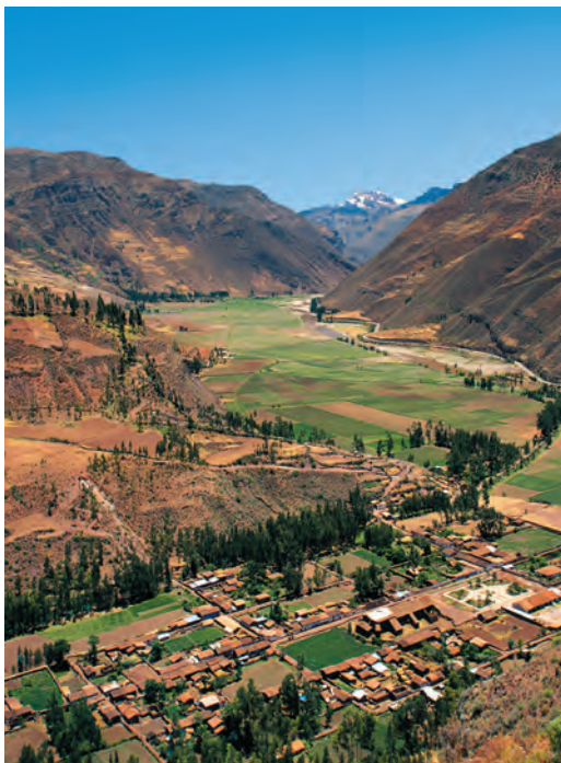
The beautiful and historic Sacred Valley