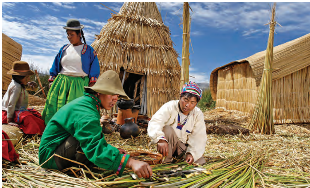
Uros Island residents weaving reeds in the traditional manner

after lunch we board a bus for Machu Picchu and our first guided visit of the stunning “Lost City of the Incas.” Thanks to its small size, our group will move nimbly through the ruins and have the leisure to absorb the beauty and mystery of this haunting UNESCO World Heritage site. Mid-afternoon we return to Aguas Calientes and our hotel, with time at leisure before dinner together tonight. B,L,D