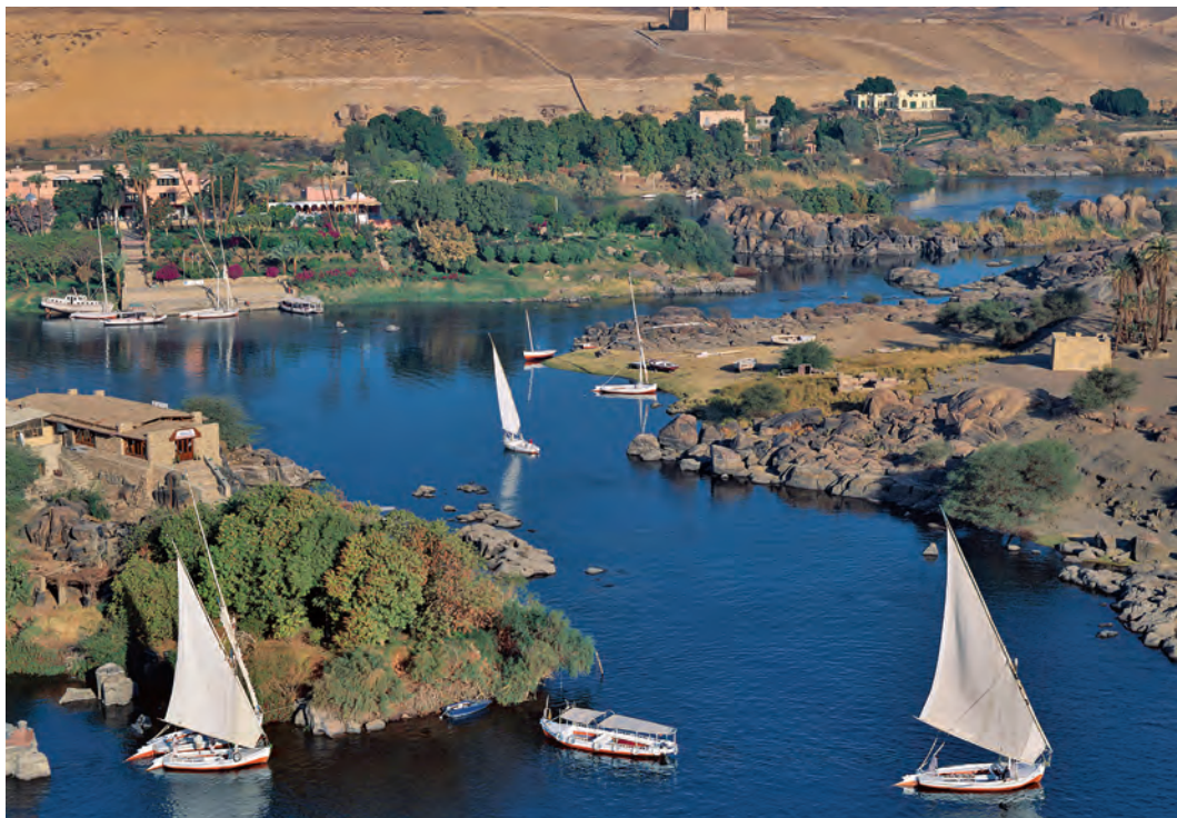
We enjoy an afternoon sail on the Nile on traditional feluccas.

Day 7: Lake Nasser Cruising – Wadi el-Seboua/Aswan We spend this morning in Wadi el-Seboua exploring the reconstructed Dakka temple, dedicated to Thoth, the messenger of the gods. We also visit the Temple of Meharakka, dedicated to Serapis, a god created to unite the Greek and Egyptian religions. This afternoon we cruise to Aswan, the city where Agatha Christie famously wrote Death on the Nile and where we spend the night on board. B,L,D