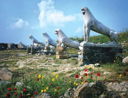
Delos' UNESCO World Heritage site ruins feature the famed Terrace of the Lions, masterfully crafted in 600 B.C.