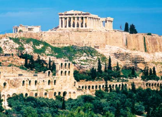
The incomparable Parthenon on the Acropolis of Athens is one of the most iconic sites from classical antiquity.

houses and the 5500-seat theater (300 B.C.), the site of choral competitions during the quadrennial Delian festival.