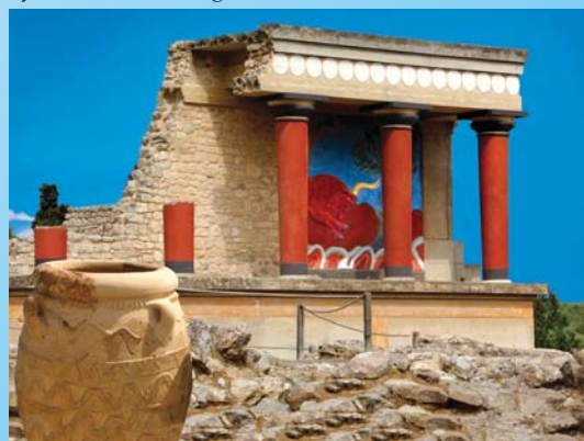
The legendary site of Knossos was excavated in 1899 by British archaeologist Sir Arthur Evans.

C'EST BON! CULINARY TRADITIONS™ OPTION: By special arrangement, savor distinctive island dishes presented by a local chef and paired with native Santorini wines.