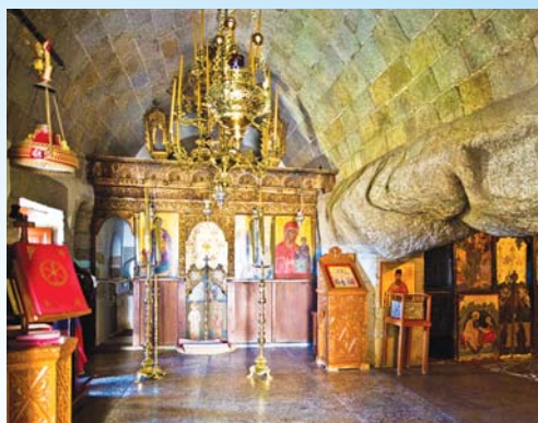
On Pátmos, St. John the Apostle is believed to have written the Book of Revelation in the Cave of the Apocalypse.

See the magnificent Terrace of the Lions, where legendary statues carved from Naxian marble have guarded the island for nearly 2600 years.