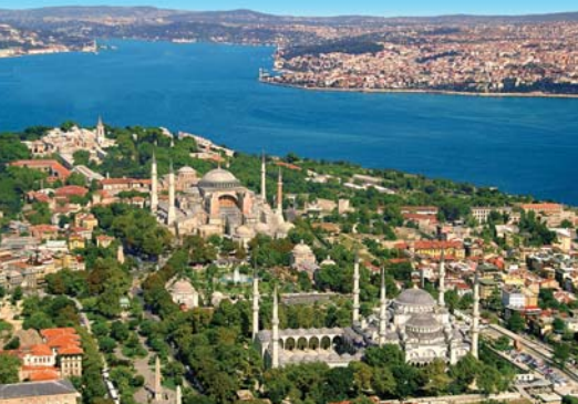
Among Istanbul's historic treasures are the UNESCO World Heritage-designated Hagia Sophia and the Blue Mosque.

A cable car descends to sea level from the elevated town of Fira, whose stunning white-walled buildings stand in stark contrast against the dark volcanic cliffs.