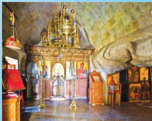
It is believed that St. John the Apostle wrote the Book of Revelation in the Cave of the Apocalypse on the Greek island of Pátmos.

This legendary metropolis straddling the Bosphorus Strait is the only city in the world that naturally bridges two continents: Europe and Asia. Its historic treasures are designated a UNESCO World Heritage site and include the magnificent Hagia Sophia, the imposing Topkapi Palace and the extraordinary Blue Mosque.