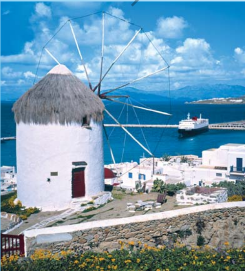
Mykonos' iconic windmills contributed significantly to the island's prosperity between the 17 th and 19 th centuries.

Be on deck as the ship cruises into the spectacular harbor at Santorini, a natural caldera, beneath which is believed to be the legendary lost city of Atlantis.