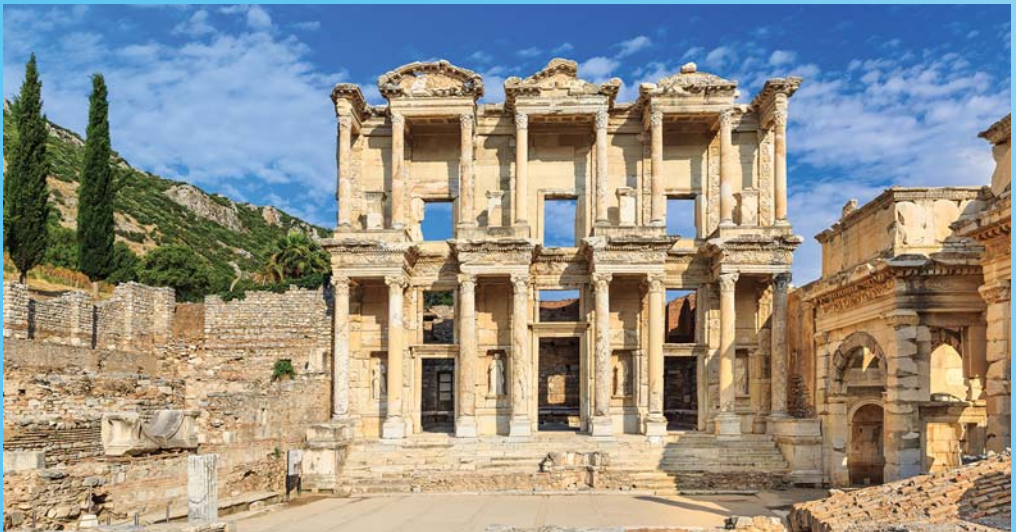
The monumental Library of Celsus, Ephesus, was a repository for more than 12,000 scrolls 1800 years ago.

Scheduled guest speaker may be altered due to circumstances beyond our control. See Release of Liability, Assumption of Risk and Binding Arbitration Agreement.