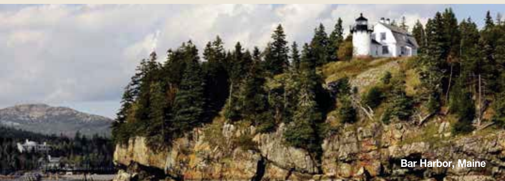
Bar Harbor, Maine

OR GO NEXT: 800-842-9023 • FAX: 952-918-8975