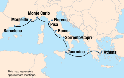
This map represents approximate locations.