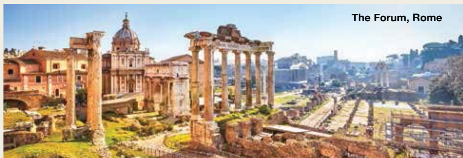
The Forum, Rome

OR GO NEXT: 800-842-9023 • FAX: 952-918-8975