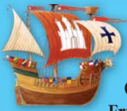
Hanseatic Cog Ship