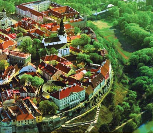
erce, reflects its history in its 600-year-old spires and gables.