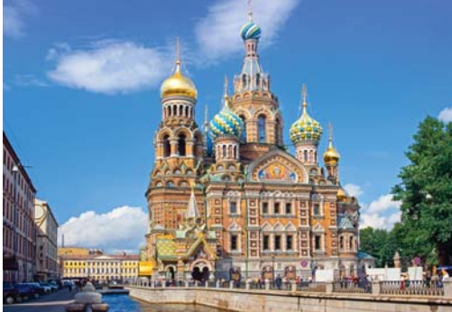
Crowned with gold crosses atop bright beveled domes, St. Petersburg's Church of the Resurrection of Christ is a dazzling showcase of neo-medieval Russian architecture.