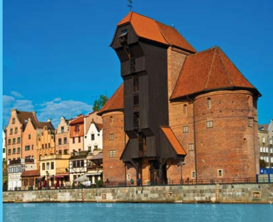
Built to haul heavy cargo and to fortify the city, the mid-15 th -century Gdańsk Crane symbolized the medieval might of this Baltic seaport.

Visit the modernistic Temppeliaukio Church, or “Church of the Rock,” impressively hewn out of natural bedrock, and Sibelius Park, where Eila Hiltunen’s remarkable sculpture honors Finland’s most beloved composer, Jean Sibelius. Then, enjoy a private concert in the prestigious Sibelius Academy.