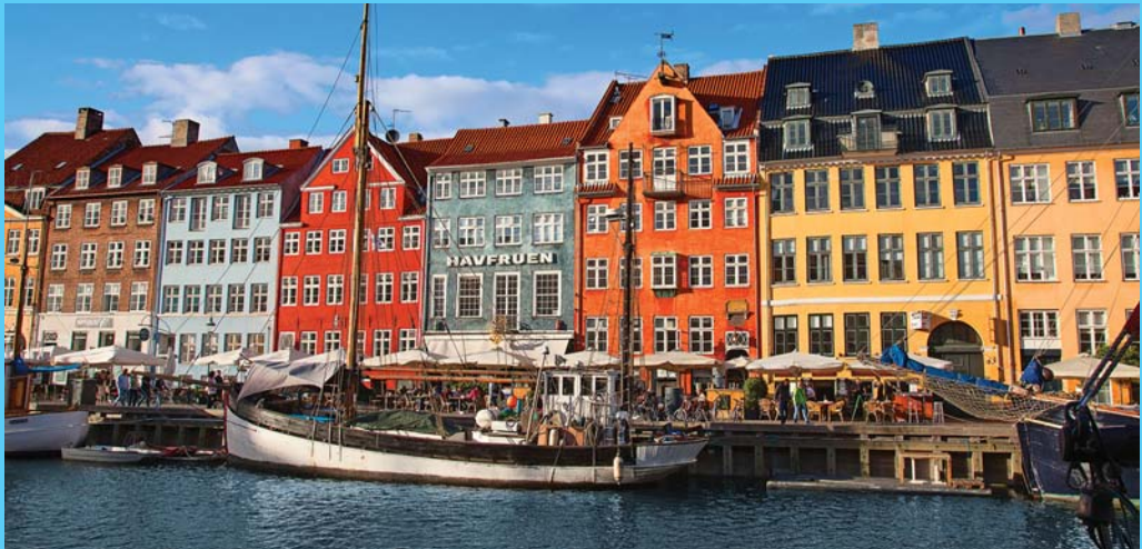
The traditional fishing boats and colorful edifices along Copenhagen's Nyhavn canal retain the waterfront's authentic 18 th -century maritime character.

This afternoon, visit the splendid parklands and extravagant Grand Palace of Petrodvorets, a UNESCO World Heritage site, commissioned by Peter the Great to rival Versailles. The elaborately landscaped grounds feature magnificent formal gardens and cascading fountains. Return to St. Petersburg by hydrofoil, skimming over the Gulf of Finland.