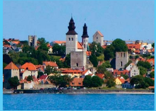
The picturesque town of Visby burgeoned as a Hanseatic League center from the 12 th to 14 th centuries.

Peter the Great founded majestic St. Petersburg in 1703 as his “Window on the West.” Cruise into the heart of the city to explore its historic center, a UNESCO World Heritage site, where legendary landmarks are scattered across more than 100 islands linked by more than three times as many bridges. St. Petersburg's main thoroughfare, Nevsky Prospekt, showcases exquisite examples of Russian Baroque and neoclassical architecture.