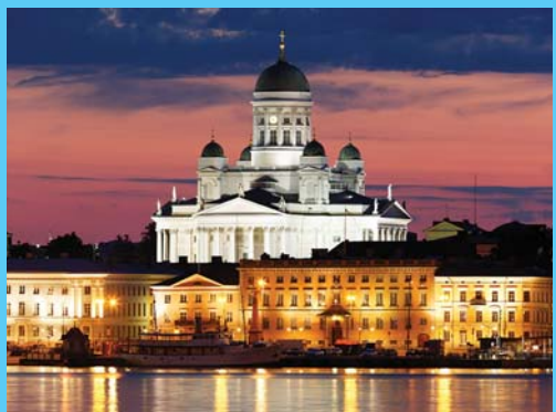
Admire Helsinki's neoclassical Lutheran Cathedral, erected during the 19 th -century reconstruction of the city center.

This afternoon, visit the splendid parklands and extravagant Grand Palace of Petrodvorets, a UNESCO World Heritage site, commissioned by Peter the Great to rival Versailles. The elaborately landscaped grounds feature magnificent formal gardens and cascading fountains. Return to St. Petersburg by hydrofoil, skimming over the Gulf of Finland.