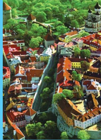
Tallinn, a hub of culture and comm

assassination, and the 19 th -century St. Isaac's Cathedral, with a striking golden dome that is one of the glories of the city's skyline. Visit St. Petersburg's first building, the Peter and Paul Fortress, constructed to secure the country's access to the sea. See the impressive Baroque Cathedral of Saints Peter and Paul, containing the tombs of 32 czars, from Peter the Great to Nicholas II, the last of the Romanovs.